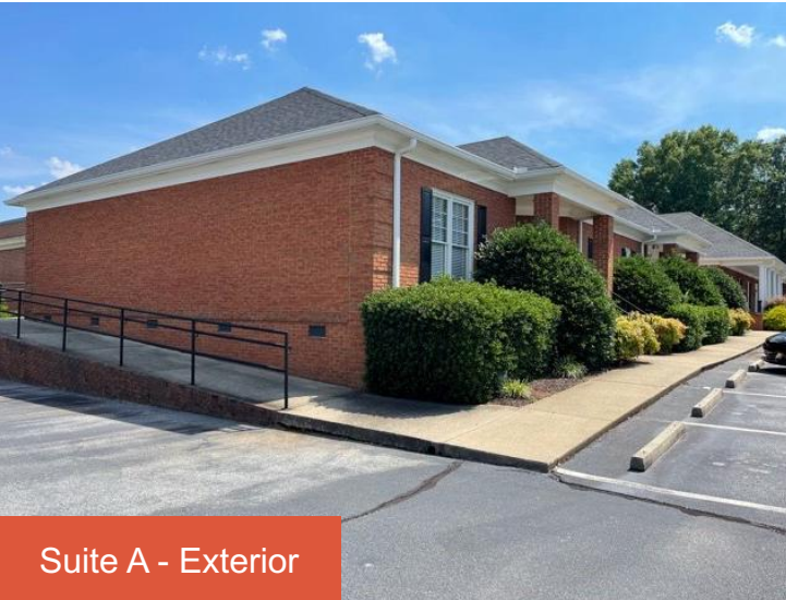
Suite A - Exterior

877 NE Main Street, Suite A Simpsonville, SC +/- 1,750 Sq. Ft.